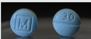
*Counterfeit oxycodone M30 tablets containing fentanyl