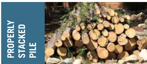
PROPERLY STACKED PILE