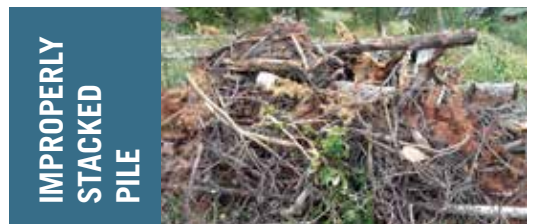
IMPROPERLY STACKED PILE